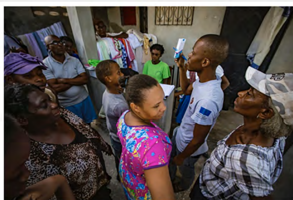
A rapid response team is distributing supplies to fight against cholera

UNICEF and the Ministry of Health continue to support a network of response teams nationwide. Four NGOs, are working hand in hand with the 13 teams from the Ministry of Health, called EMIRA (in French, Equipe Mobile d’Intervention Rapide), to deliver a complete package of activities: visiting affected households and an average of 12 houses living in a 50m perimeter around the patient’s house and establishing a “cordon sanitaire” to avoid the disease from spreading in the community. The teams provide oral prophylaxis to the patients and their families, disinfect homes, and distribute oral rehydration salt, soap and water chlorination tablets. They also secure water sources by establishing emergency water chlorination points or support DINEPA (National Directorate for Drinking Water and Sanitation) to chlorinate the water systems in affected areas when needed.